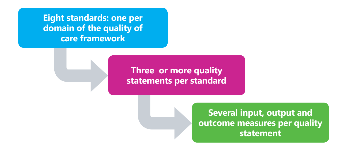
Fig. 2. Structure of the standards